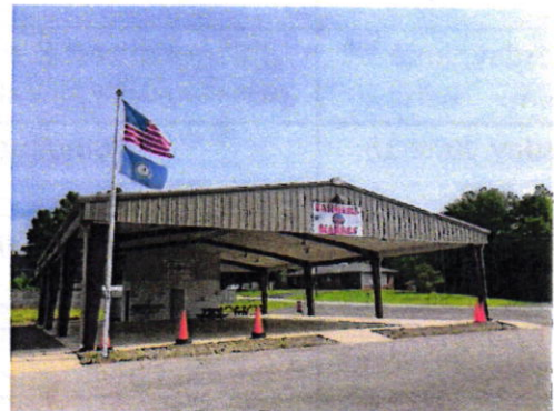
Farmers Market @ 422 East Street Fridays from 8-1 PM