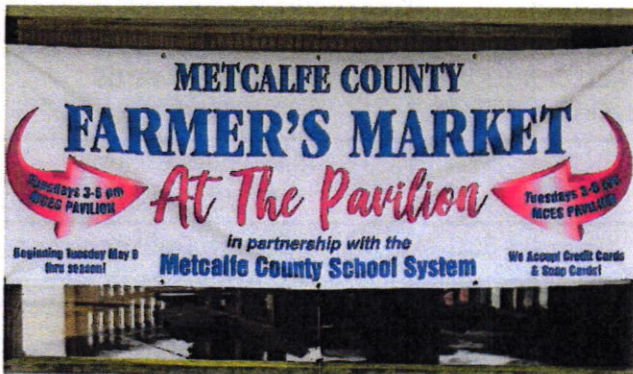
Farmers Market @ the MCEC Pavilion Tuesdays from 3-6 PM