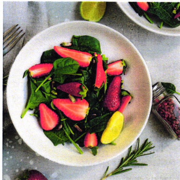
Spinach & Strawberry Salad with Jam Dressing (Recipe on page 2)

The College of Agriculture, Food and Environment is an Equal Opportunity Organization with respect to education and employment and authorization to provide research, education information and other services only to individuals and institutions that function without regard to economic or social status and will not discriminate on the bases of race, color, ethnic origin, creed, religion, political belief, sex, sexual orientation, gender identity, gender expression, pregnancy, marital status, genetic information, age, veteran status, or physical or mental disability. Inquiries regarding compliance with Title VI and Title VII of the Civil Rights Act of 1964, Title IX of the Educational Amendments, Section 504 of the Rehabilitation Act and other related matter should be directed to Equal Opportunity Office, College of Agriculture, Food and Environment, University of Kentucky, Room S-105, Agriculture Science Building, North Lexington, Kentucky 40546.